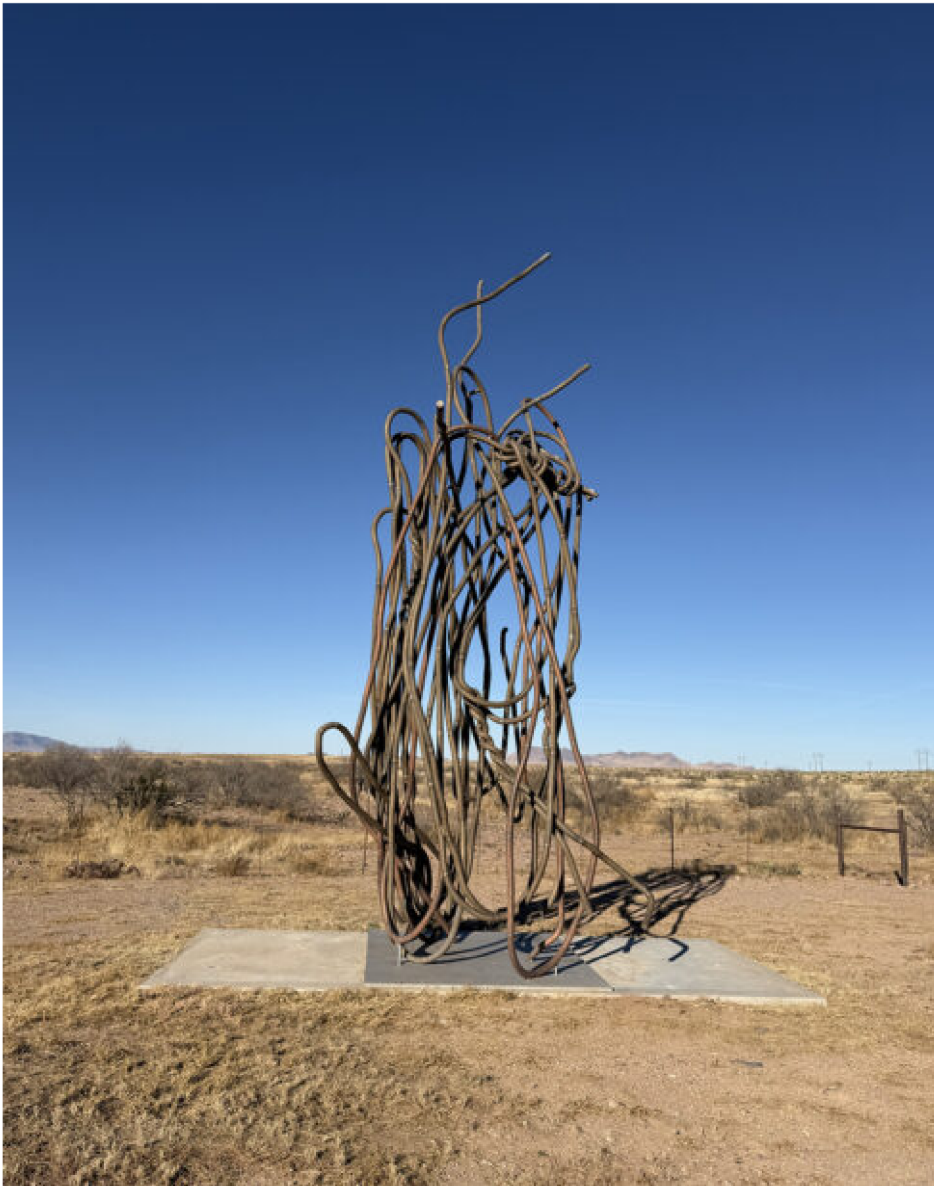
A work by Christopher Wool on view in Marfa

A special experience and thoughtful touch in both New York and Marfa was the inclusion of elephant size folios with prints of work on paper and silkscreens: all lined up on a table for individual perusing. The bindings open flat; the paper, good rag. These compendiums have the intimacy of going through racks of paintings in a studio without another person around. It was good to touch the work. The addition, a stroke of genius.