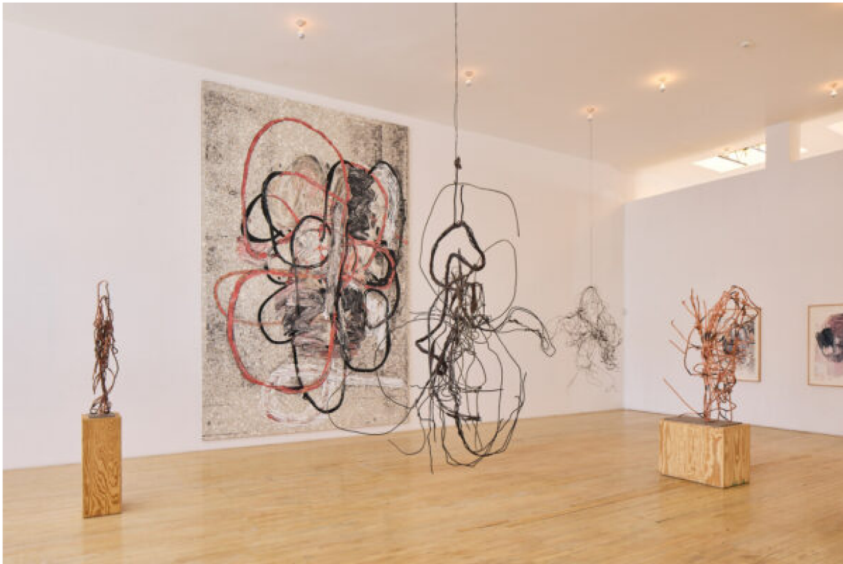
An installation view of Christopher Wool's "See Stop Run" on view at the Brite Building in Marfa.

Following the repeating patterns in loops of paintings and loops of wire, a summation of the parts, seems Wool has found himself at ease in revisiting his earliest mark making. Learning to read and write involves mimicking shapes, black ink, paper and study of letter making, and it all makes a strong showing here. Even the pink of the oil on prints reminds of pencil erasers.